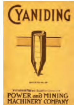
A catalog illustrating mining equipment for processing ore using cyanide

The frequent application of nitroglycerine blasting compounds that were used for extracting gold contributed to a large number of mining fatalities in the early 20th century. Nitroglycerine compounds used in mining must be heated and cooled at precise temperatures. If handled improperly, the smallest amount of nitro powder can burn and emit significant amounts of carbon monoxide, poisoning miners who inhale it. Over the course of about 30 years in Idaho, the number of mechanical- and chemical-related mining accidents in Idaho claimed the lives of hundreds of working men in the mining