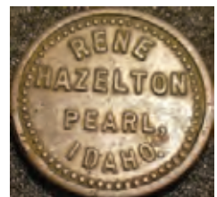
Saloon token, Pearl, 1904