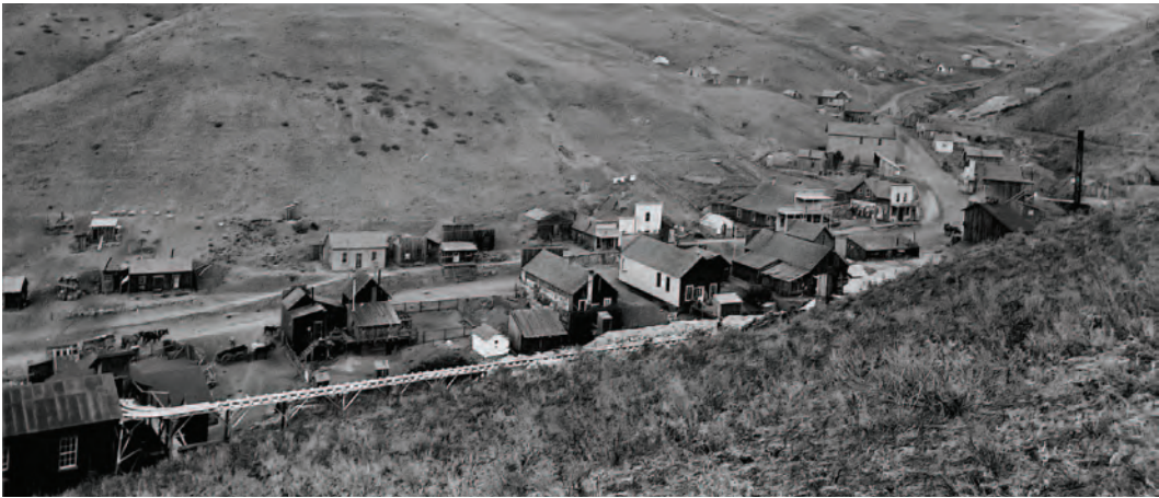
The streets of Pearl, Idaho, near the Diamond and Checkmate mines